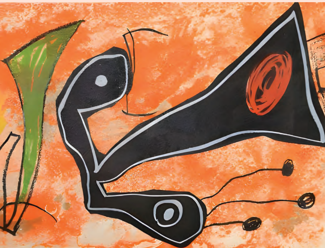
Image credit: Joan Miró, Untitled, 1974

This exhibition showcases Joan Miró’s dynamic lithographic prints, created to illustrate the writings of French Surrealist poet Robert Desnos. This collection demonstrates Miró’s remarkable versatility, bringing together his unique creative process and lasting influence on the art world.